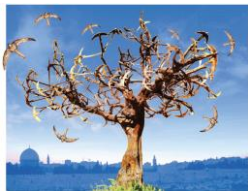
Swift Tree Cards (pack of 5, blank inside) £5