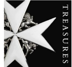
'Treasures' by Tom Foakes £50