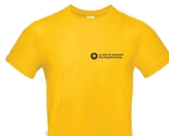
Unisex SJEH Tshirt (Gold) S/M/L available £15