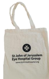
Cream Tote Bag £3.50